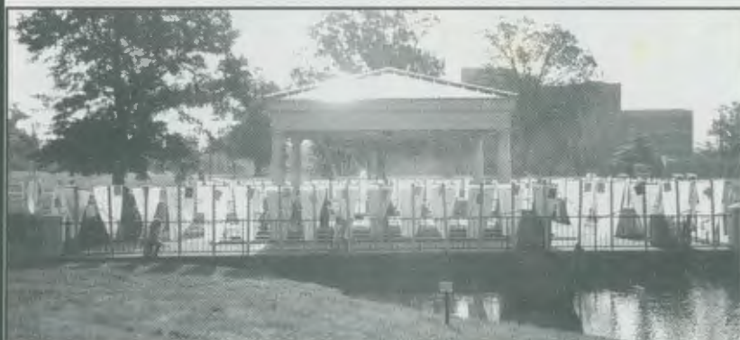
Hate-Free Arkansas Campaign kicks off at MacArthur Park in June 2000.