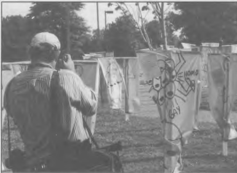
News photographer covers June 2000 event.

The Hate-Free Arkansas campaign hopes to reactivate its organizing component and involve communities across the state in monitoring acts of hate and bias. The campaign has three scheduled stops over the next year including Texarkana, Jonesboro and Monticello. It has received some wonderful coverage from media across the state and country including brief coverage in USA Today (January 15, 2001). Ultimately, we hope to have monitoring teams and community organizations in each region of the state building relationships and sharing resources to create a Hate-Free Arkansas!