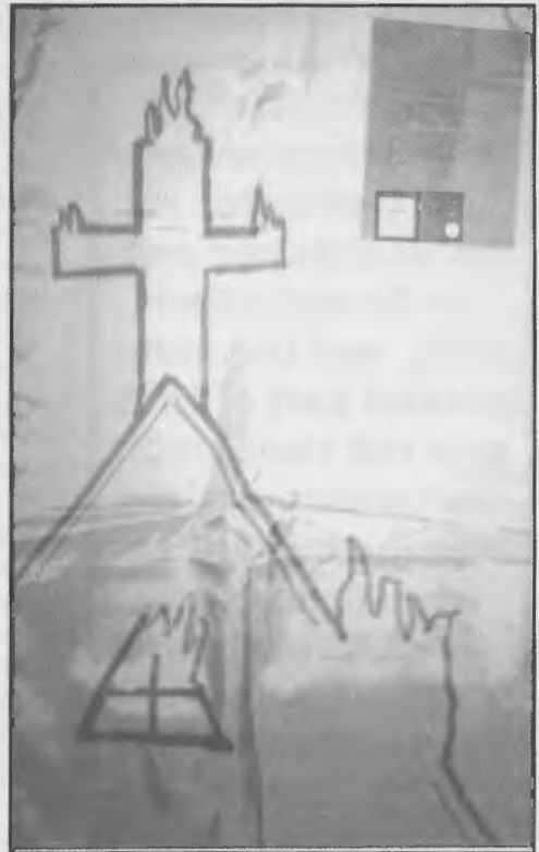
Hate-Free Arkansas banner gives visibility to the problem of church burnings in Arkansas.

Community involvement in passing the legislation was stronger than ever before as well. For the first time, there was a statewide progressive organization advocating for equal rights for gay, lesbian, bisexual, and transgender people that was taking an active and visible role in educating folks about hate crimes legislation (past attempts at passing a hate crimes bill had been met with strong arguments against the inclusion of sexual orientation as a protected