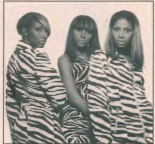
Towanda, Tamar, and Trina Braxton

Stereo Type Headquarters: 75 Rockefeller Plaza, New York, NY 10019