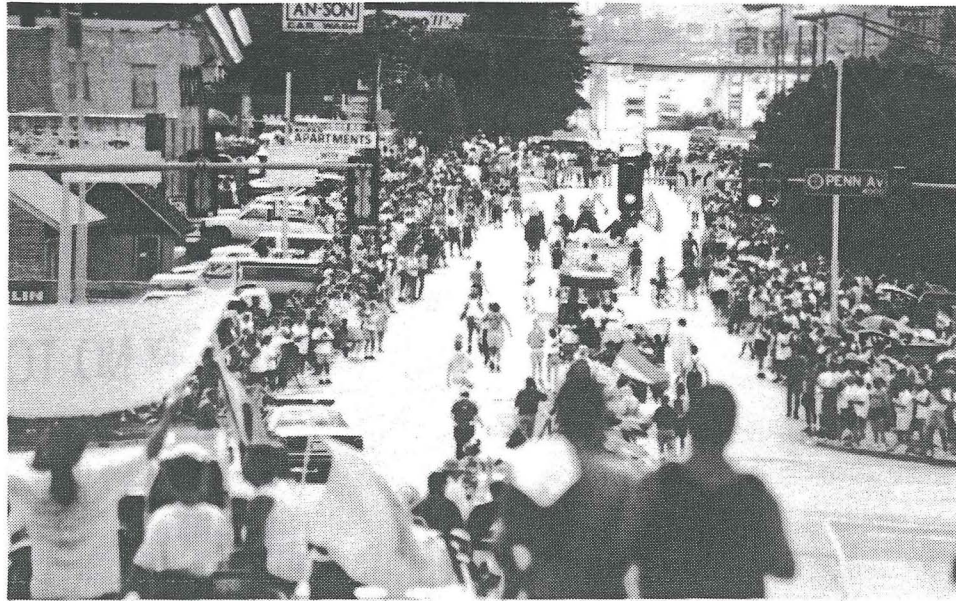
Crowds of spectators greeted the parade at 39th and Penn.