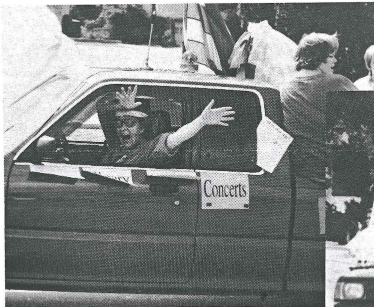
Herland's parade entry. Herland has participated in all 10 Oklahoma City Gay and Lesbian Pride Parades.