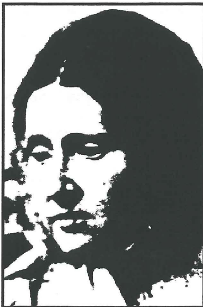
Julia Ward Howe