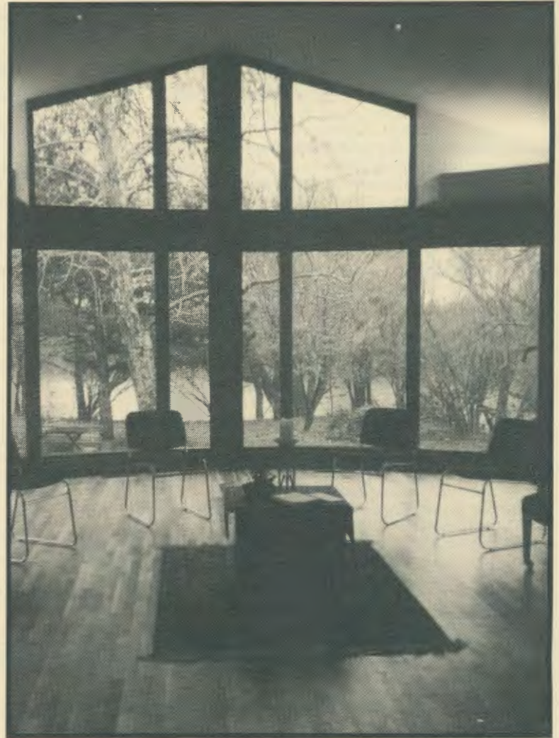
Embracing arms of central crucifix are focal point in new chapel.

God bless these gallant women who follow the Lord for our sakes.