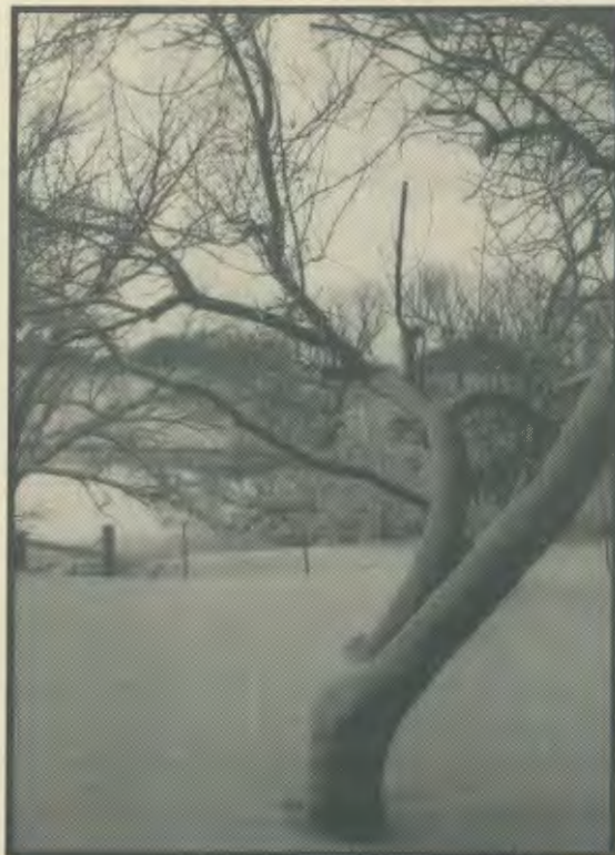
Old makes way for new as favorite tree is relinquished for chapel space.

A s you view these pages, with its many photographs by Sister Miriam Schnoebelen, celebrate with the Sisters their move to their expanded living spaces in the Monastery on Oklahoma’s red prairie!